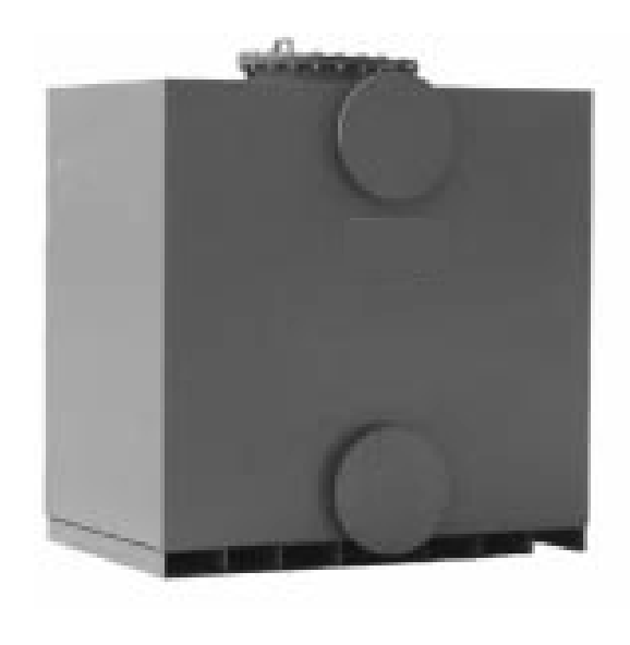
GEE High Flow Carbon Adsorber Design